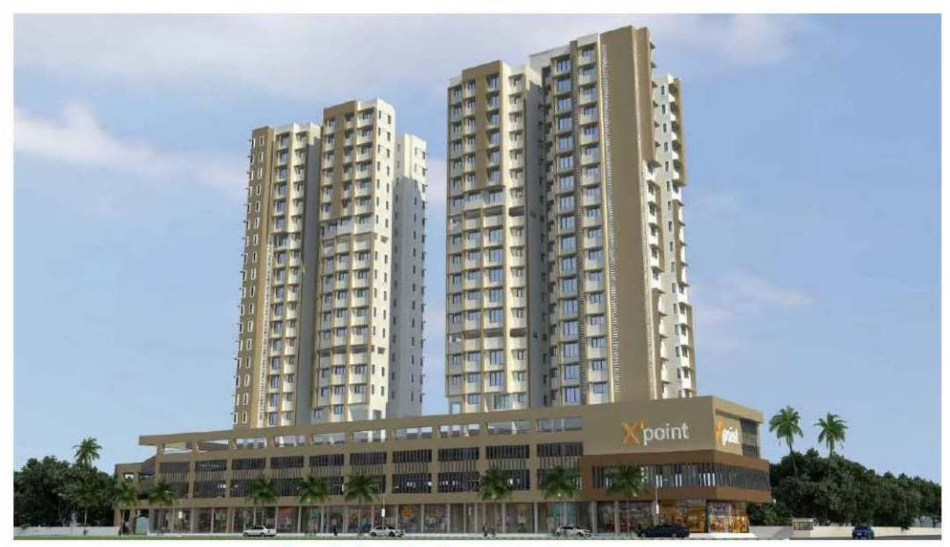
Reside Relax Rejuvenate