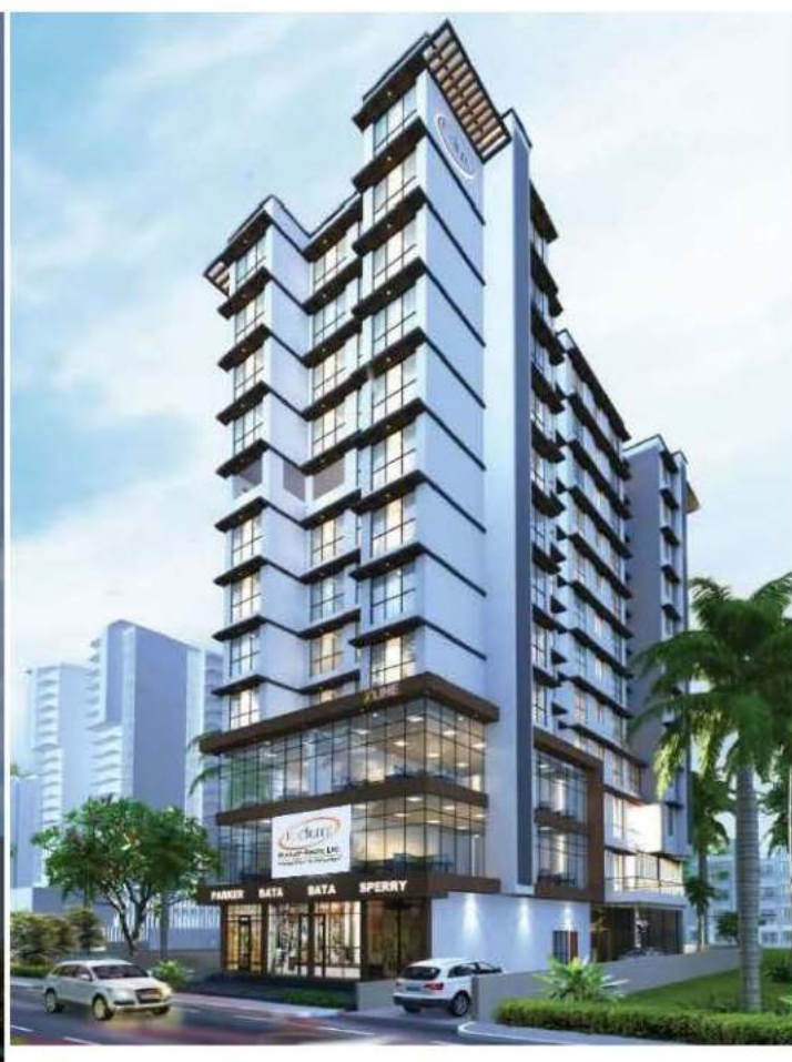
Smart Serene Spectacular