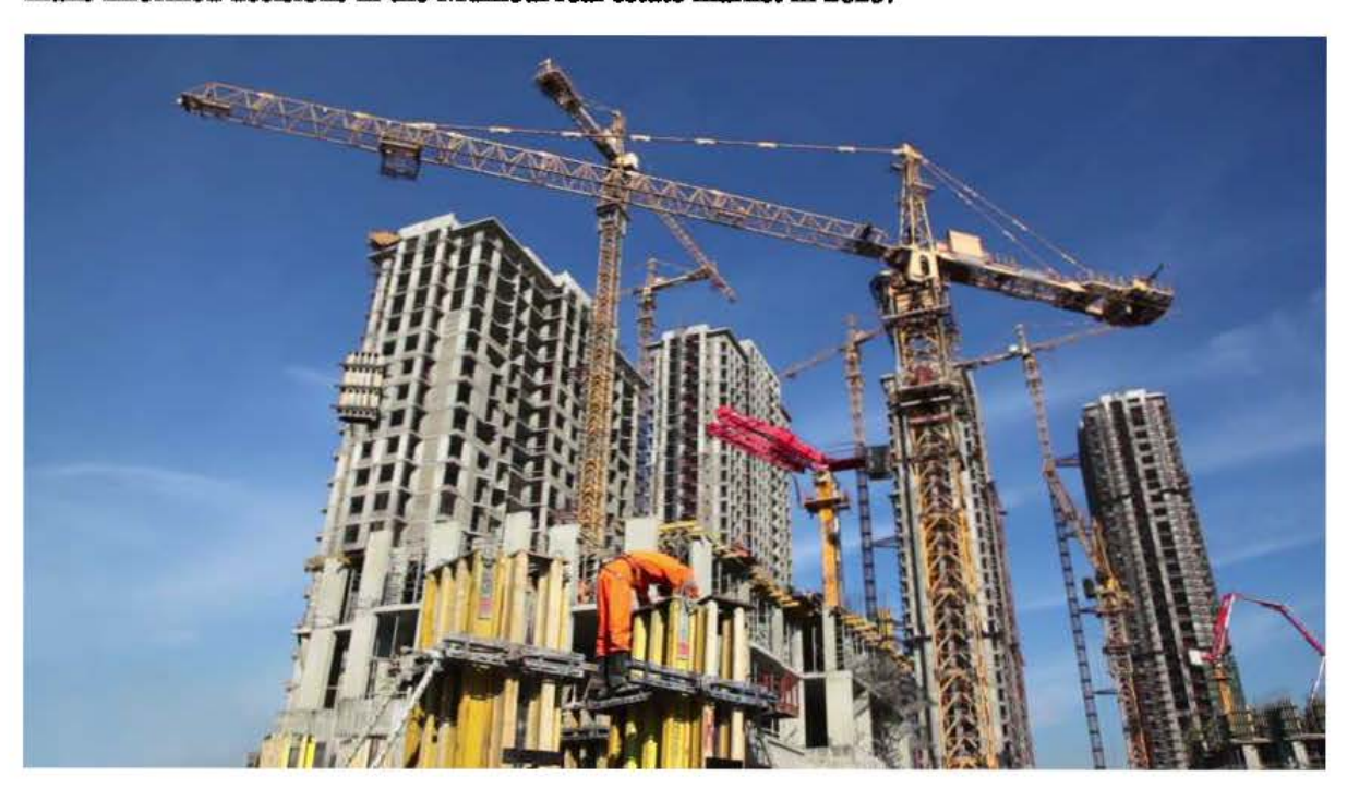
"Buoyed By Major Infrastructure Developments and Resurging Demand for Homes, The Country's Residential Real Estate Market Is Set for Another Year of Healthy Growth."

However, as per the latest Mumbai real estate market forecast, challenges, such as increasing construction costs, liquidity issues, and regulatory changes, could impact the market. Understanding these factors and their potential impact will be critical for developers, investors, and homebuyers to make informed decisions in the Mumbai real estate market in 2023.