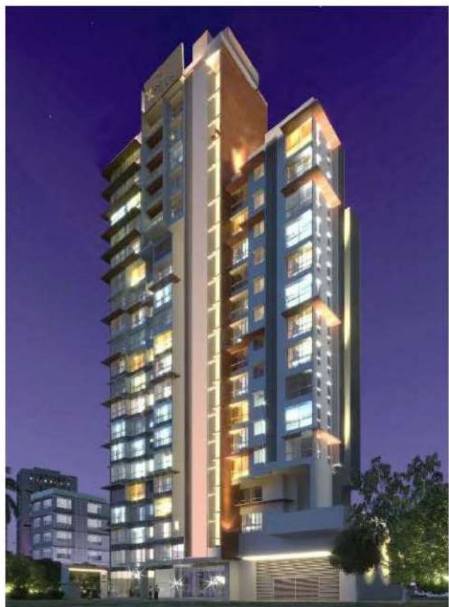
Where Life Resides