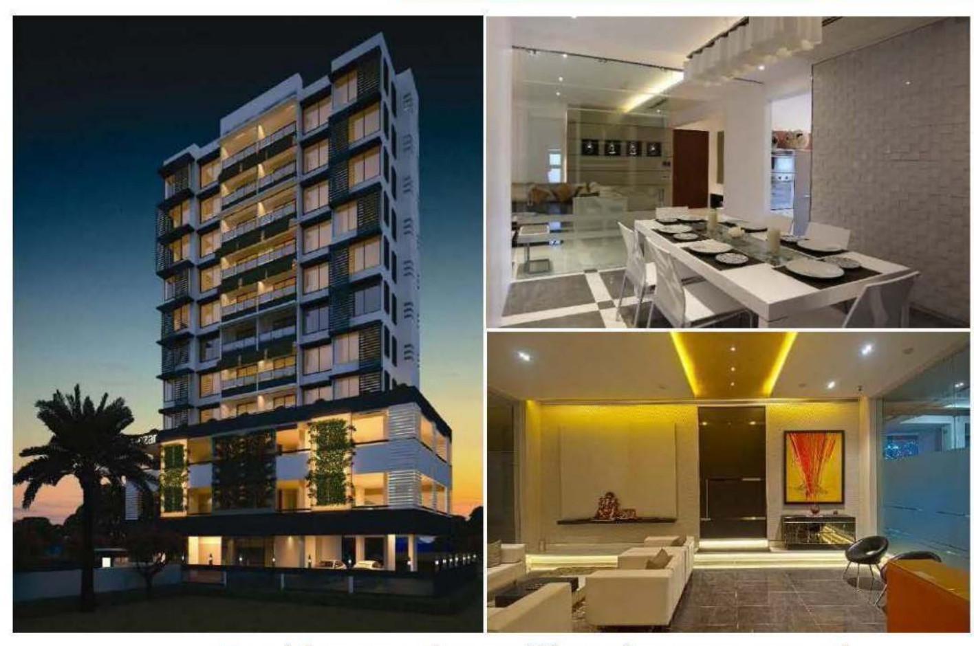
Residences that will make you proud